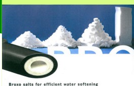
Broxo salts for efficient water softening