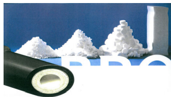
Broxo salts for efficient water softening

Many areas in Ireland encounter problems with hard water, Nutribio carry a range of Broxo water treatment salts to help combat this hard water issue.